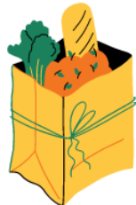
Emergency Food & Household Items